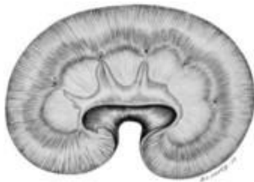
Cross section of a normal kidney.

Hereditary kidney disease has long been a problem that Bull Terrier fanciers are familiar with and work actively to eliminate. Hereditary nephritis is the more common and well-known form of kidney disease, but a second heritable kidney disease is also a threat that may be less familiar. Polycystic Kidney Disease (PKD) is a slowly progressive, irreversible kidney disease that can result in renal failure.