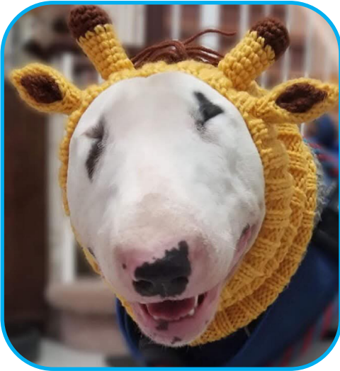
"POSSESSED OF A GREAT TURN OF GAITY & DROLLERY" - SIR WALTER SCOTT

They have a great sense of humor - of clownish nature, they love to be the center of attention and to ham-it-up. They are a constant source of entertainment to those around them.