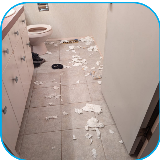
DEDICATED ENGINEERS OF MAYHEM.

They like to be entertained: and if they don't have it - they'll create it. They have an unwitting way of finding mischief.