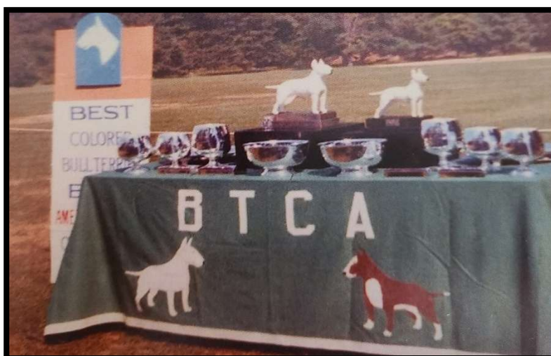
Trophy Table 1970.

The purpose of this competition is to bring together at one time in one place America's outstanding Bull Terriers so that their virtues may be assessed and appropriately recognized. In this situation, breeders will have an opportunity to inspect America's top Bull Terriers and become acquainted with and talk to breeders from other sections of the country. They will be able to relate their own progress to the breed as a whole and make decisions concerning future matings that should move the breed forward at an accelerated pace. It is hoped that through this activity better understanding and closer cooperation will develop throughout the entire Bull Terrier fancy.